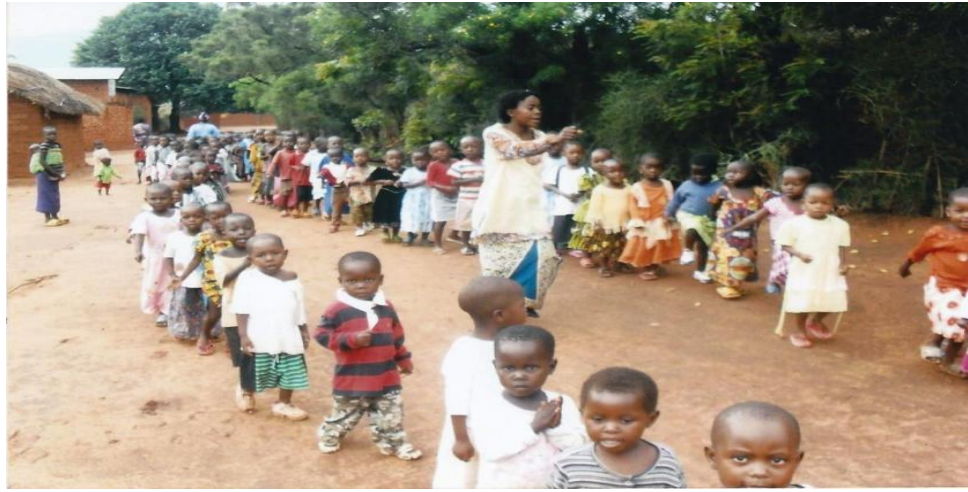
The children at Dietsch Academy Sange /MHCD Sange School (2011 school year students)