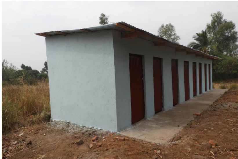
New School toilets