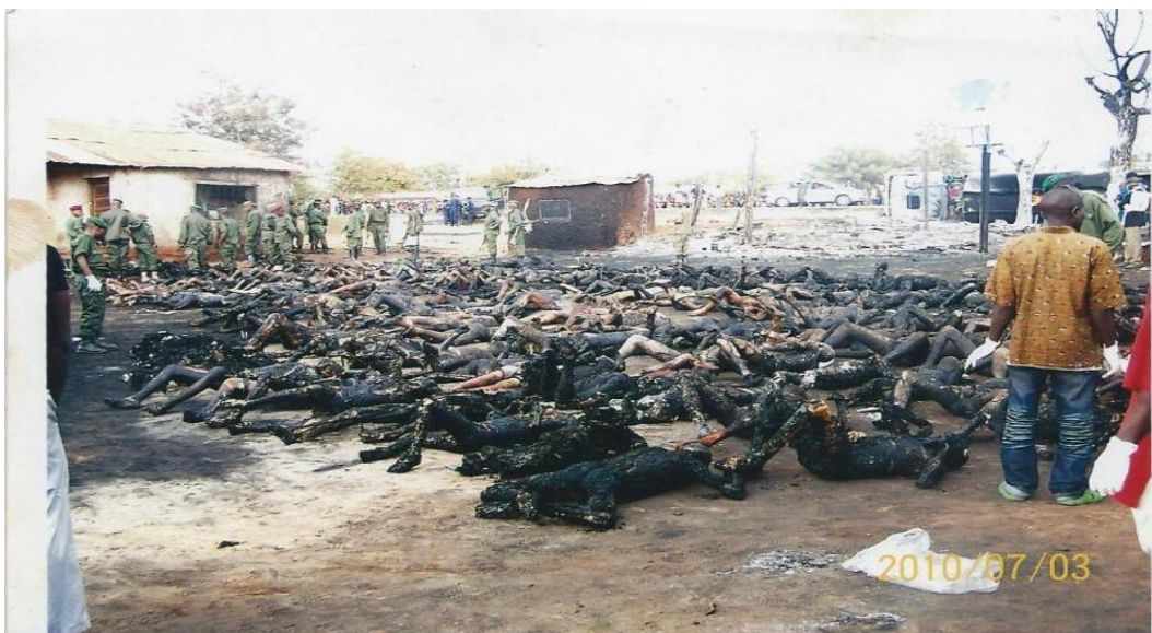
The photo of the Sange people who were burnt alive by the petrol tanker.

These children suffer a lot and live in a miserable condition.