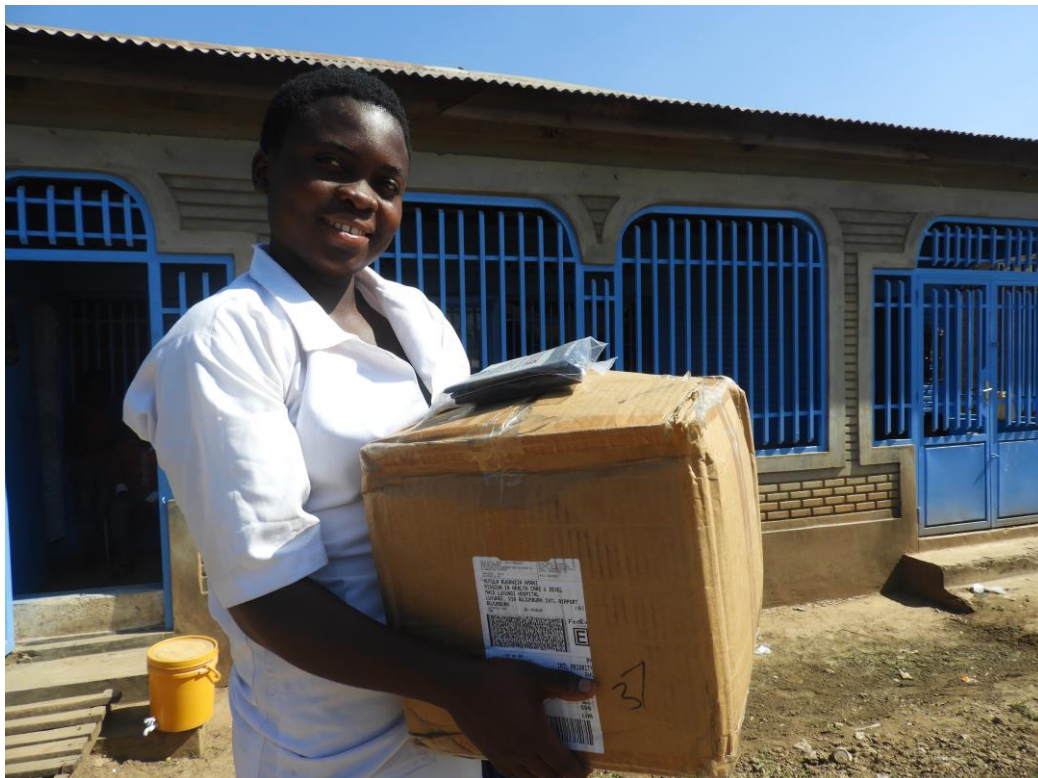
MHCD Midwife carrying birthing Kits at the MHCD Uvira clinic