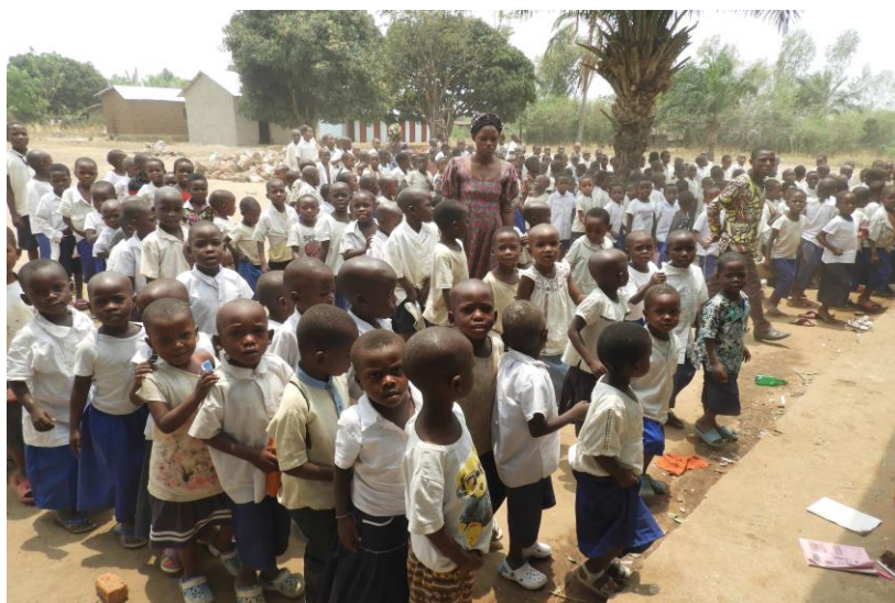
2022 School Year Students