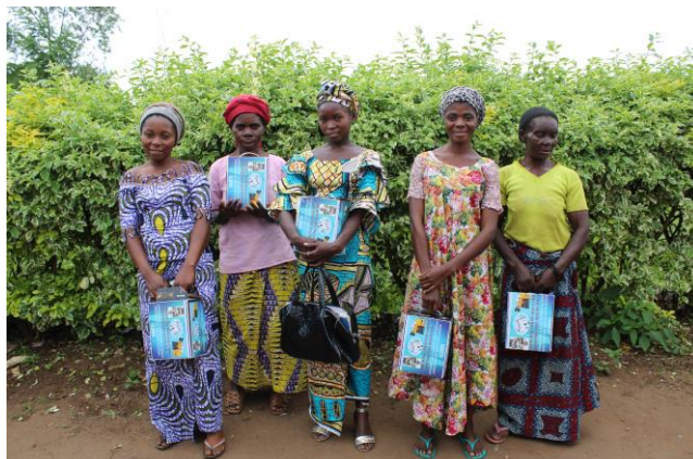
Traditional Midwives receiving Solar Kits from MHCD