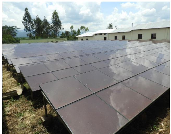
MHCD Luvungi Solar Farm