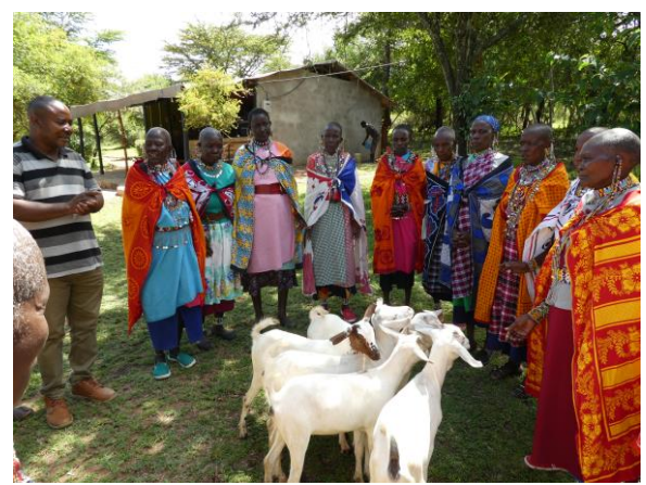
Launching of the Goat Distribution Project in Maasai Mara