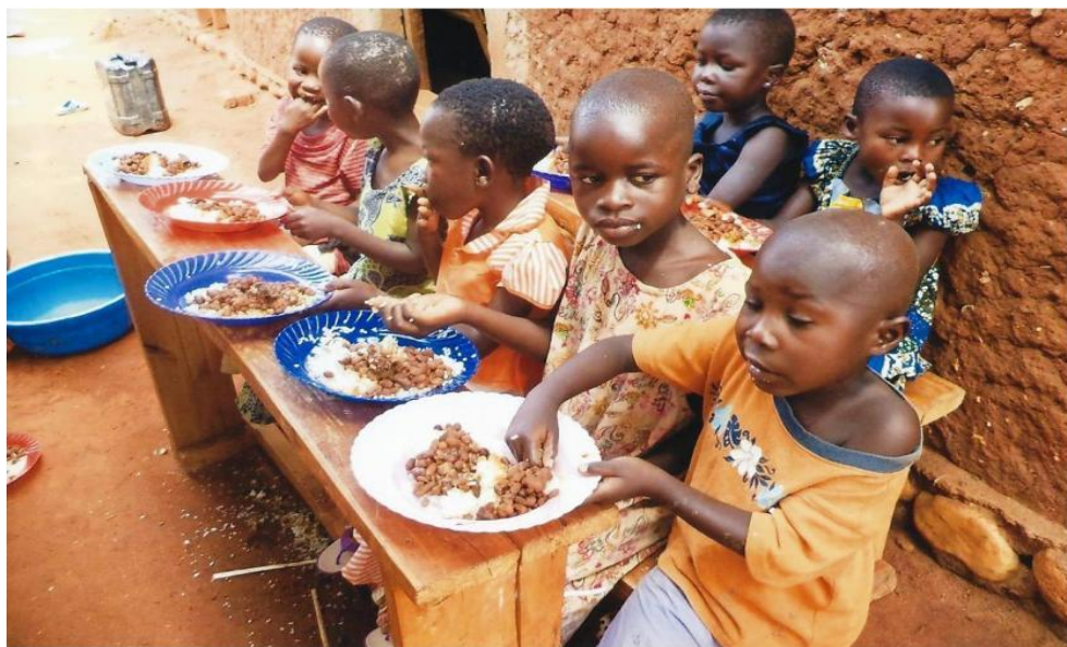
The children having lunch in front of their class.