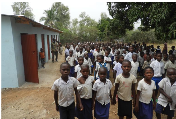
The 2022 school year students launch the new school toilettes.