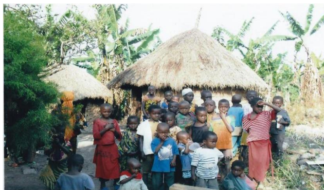
The children in Sange village in their house where they sleep.

Lastly, I thank all MHCD Friends and Supporters who are supporting microfinancing program, food and contributed to the toilets and school construction in Sange village. May God bless you all and please know that we love you so much and appreciate everything you are doing for the Sange Village.