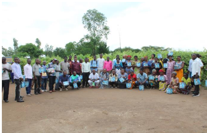
MHCD Staff receiving Solar Kits