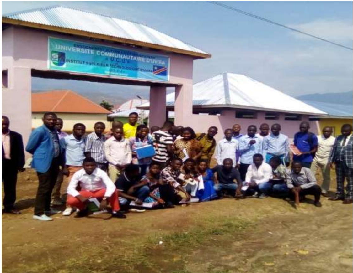
Uvira Community University Students