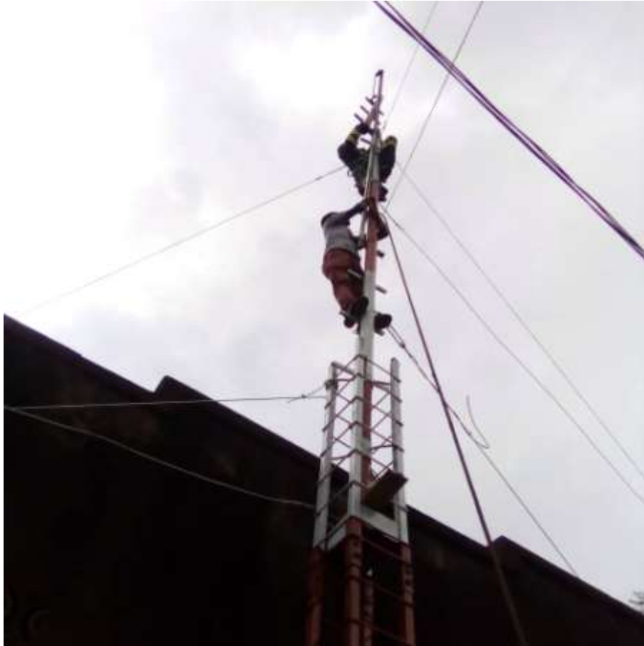
Impact Radio Uvira Station New Antenna