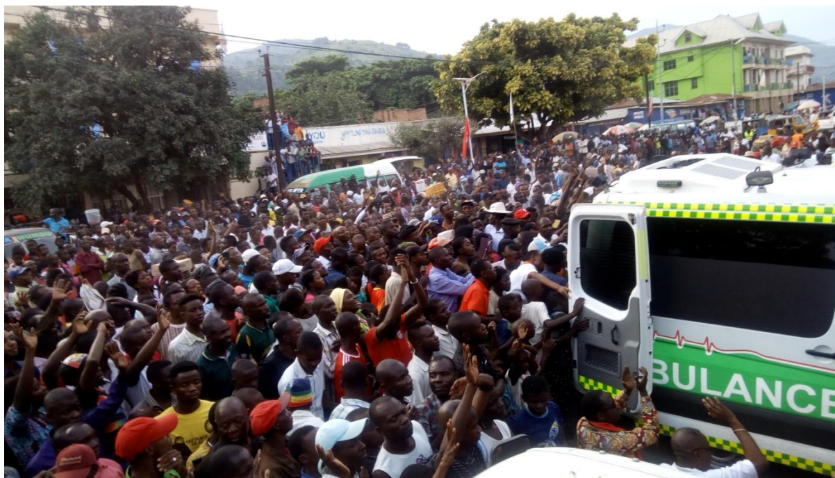
Uvira population coming to have a look at the ambulance.