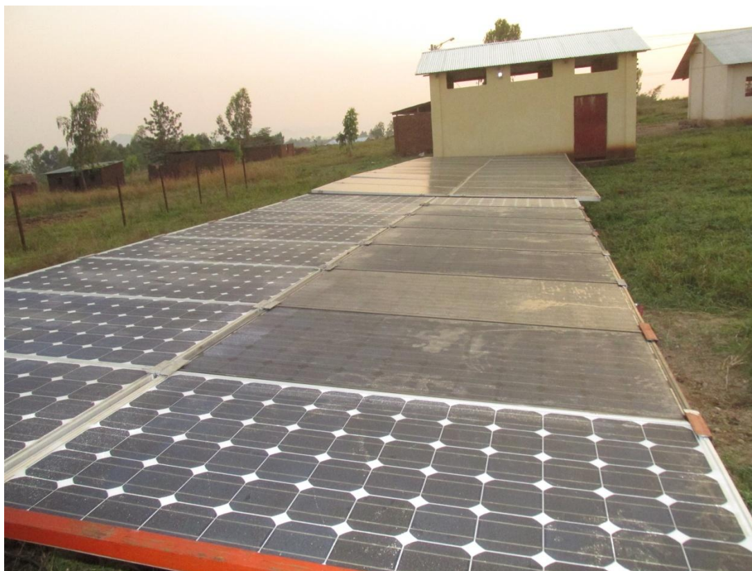
New MHCD solar station.