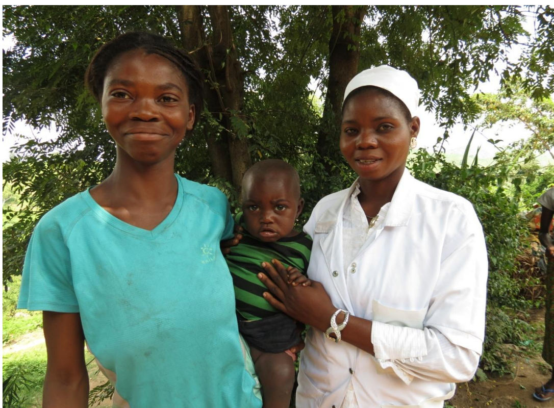
MHCD Midwives with new mothers and babies they helped deliver.