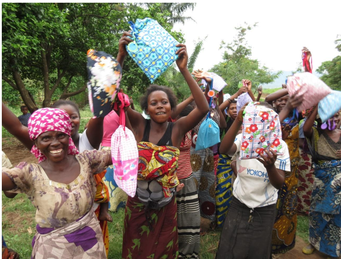
Days for Girls Distribution.