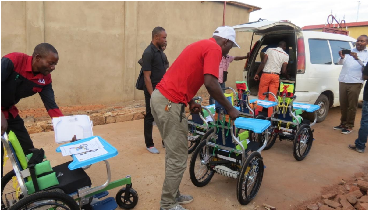
After reassembling the wheelchairs they are ready to be distributed to children.