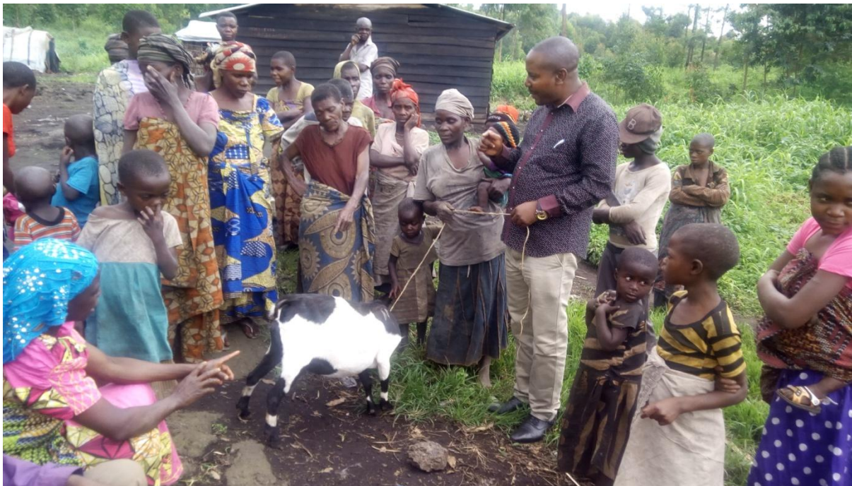
Nyiragongo pigmies receiving goats from MHCD. Each family received one goat.