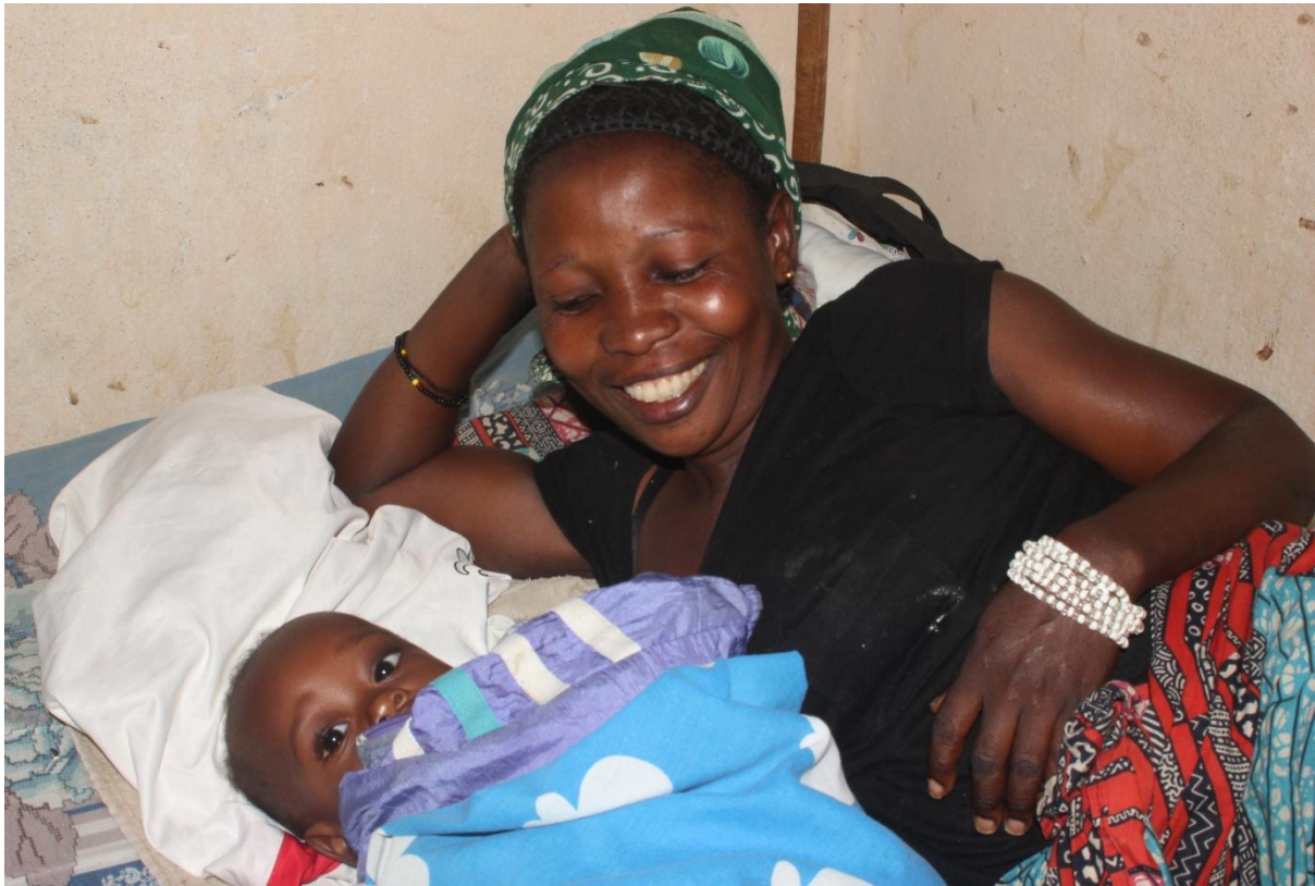
This Mother is very happy after her child received treatment at the Ronda and Arthur Mother and Child Clinic.