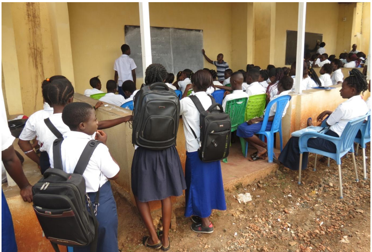
Some of the school students learning at the MHCD restaurant because of lack of classes while some are learning while standing due to lack of chairs.