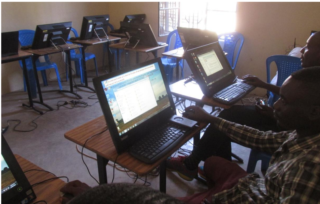
MHCD Computer for Congo Cyber cafe