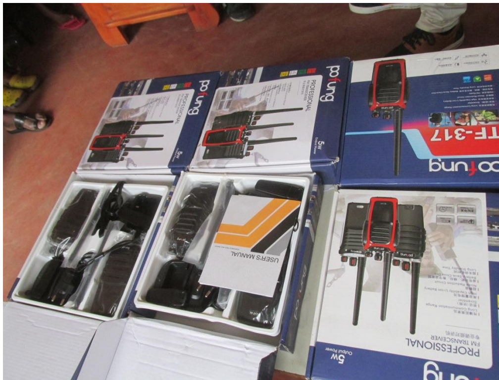
Radio calls and mobile phones ready for distribution.