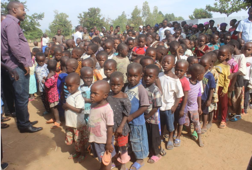
Pupils of the Dietschs Academy before getting school Uniform.

whereby we organised food for the children with their mothers or guardians and this brought about lots of happiness to them. We had constructed two rooms' classes that have proven to be small for them and so we would like to expand on them that we have laid the foundation and which will be more modern. 2 Thank you very much for all your support and prayers. Please do not tire in continuing to support Dietschs Academy Sange.