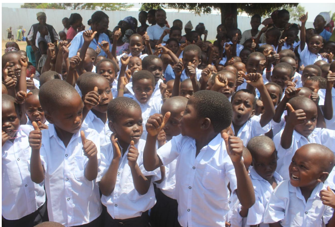
Pupils very happy for getting free uniforms and sandals.