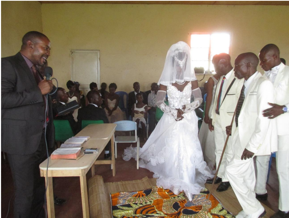
The new couple celebrating their wedding at the Pamela centre.