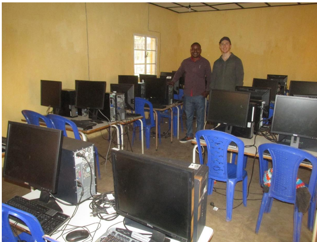
MHCD and computer for Congo training centre.