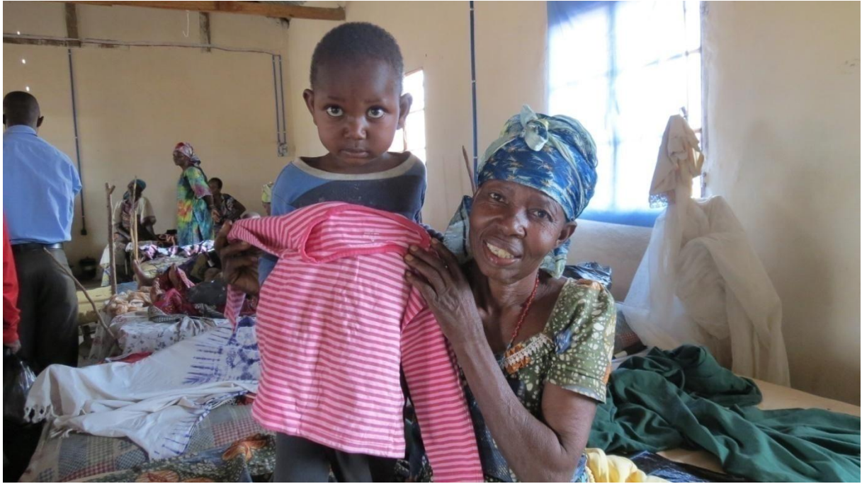
The children in the Paediatric ward are happy to receive clothes. The mothers received clothes too.