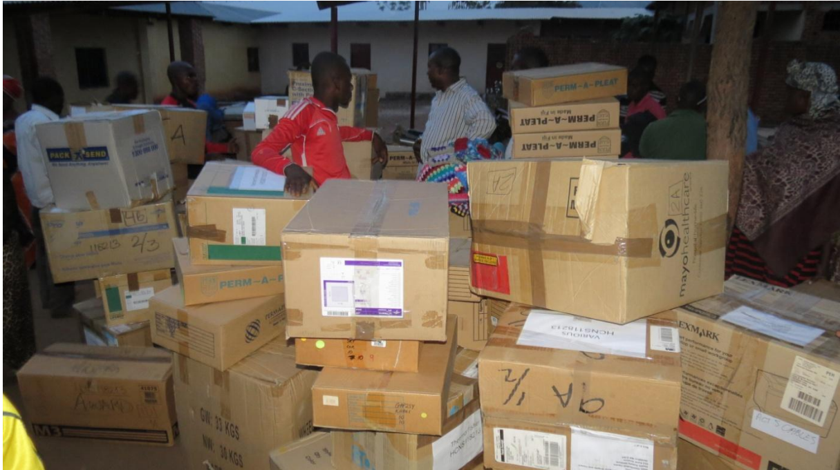
Boxes of different medical materials that we received.