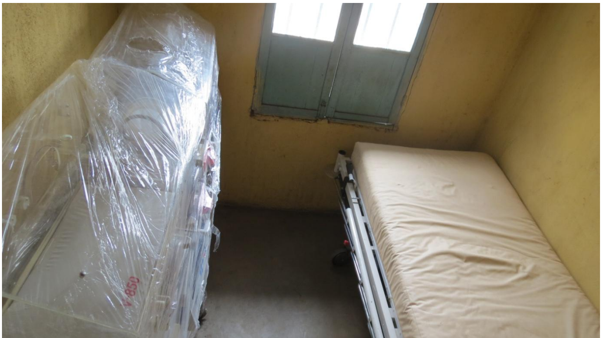
Community offloading the incubators and above they have already been installed in the hospital.