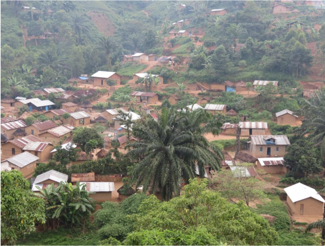
This is one side of Bunyakiri village.