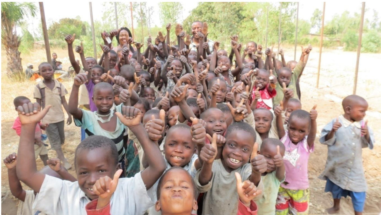
Pupils of class two Nursery school Dietsch Academy Sange