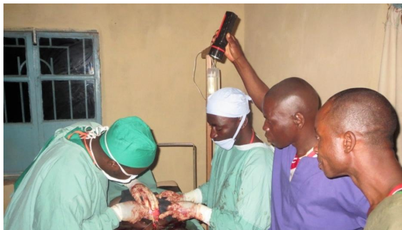
MHCD Doctors operating using a torch.

Before the solar station,it was very difficult to carry out tasks at the Luvungi Hospital at night.Doctors carried out operations by use of torches,women gave birth at the maternity by use of torches,consultation and administration of medicines at night was very difficult,even women coming to the Hospital at night was a big problem because of lots of insecurity.