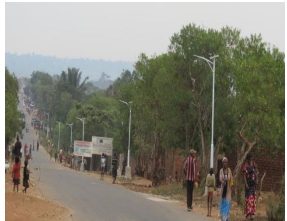
Engineer Ling from China installing streetlights in the main street of Luvungi.