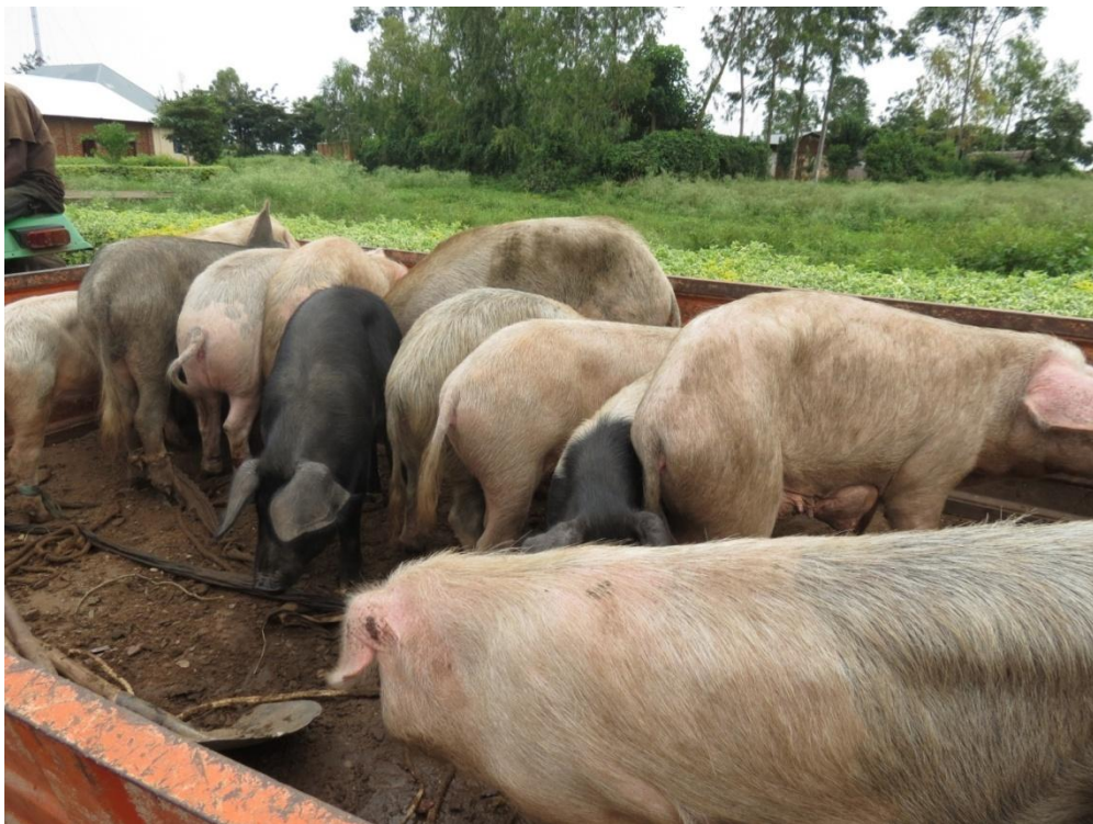
Pigs on a tractor ready to be distributed to different clubs in one village .This is how we were distributing the pigs.