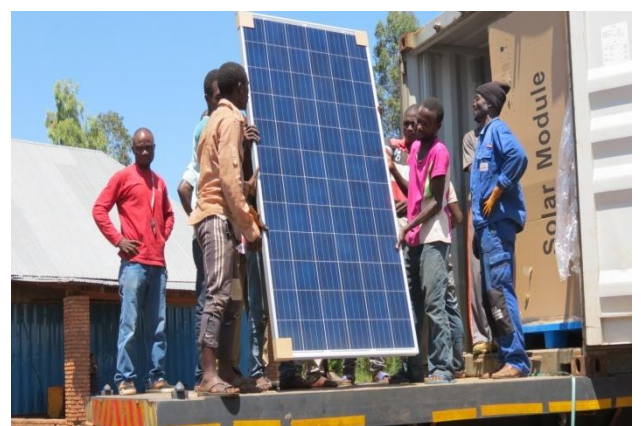
The Luvungi community offload the container