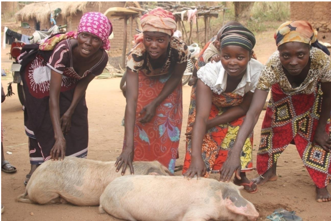
The women here are very very happy to receive the pigs. You can see the joy in their faces.