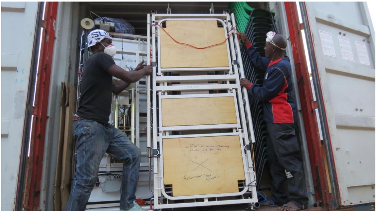
Luvungi community have begun offloading the container