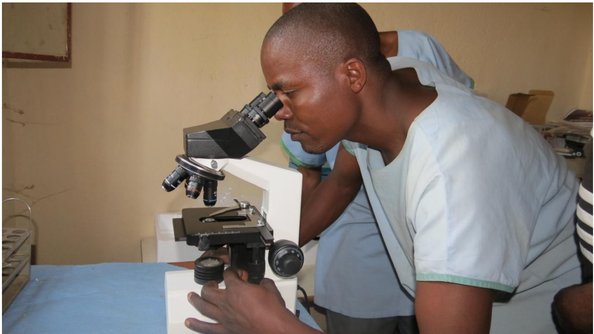
The MHCD medical officer checking up the microscope that also uses solar power. All equipments in the laboratory are now functioning with the help of the solar energy.