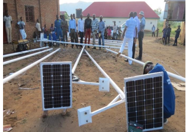
Assembling of solar street lights