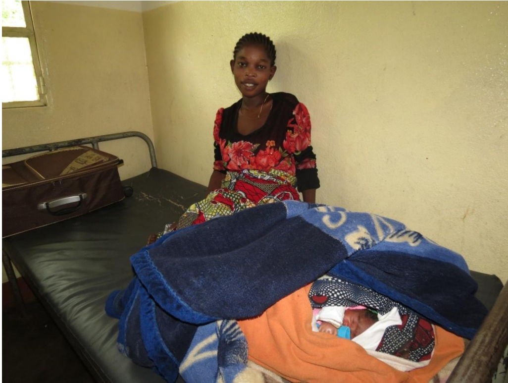
The lady and her baby at the health centre.