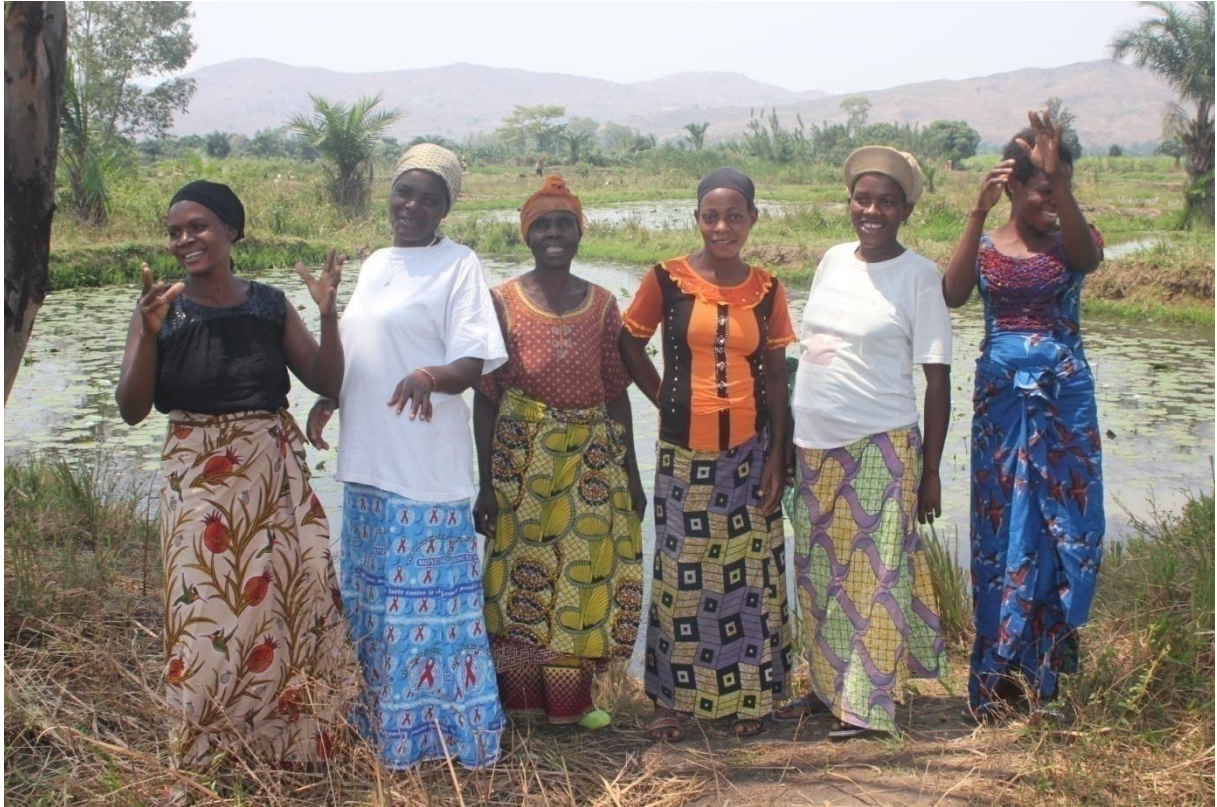
Women leaders from different clubs from Snge village are happy to visit and see their fishpond. MHCD leaders paid them a visit to see the good work they are doing.