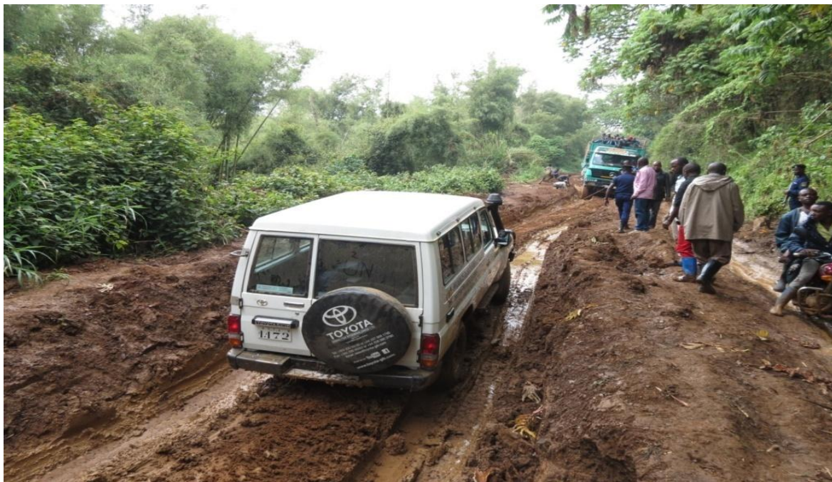
This is our vehicle driving on the road to Bunyakiri.