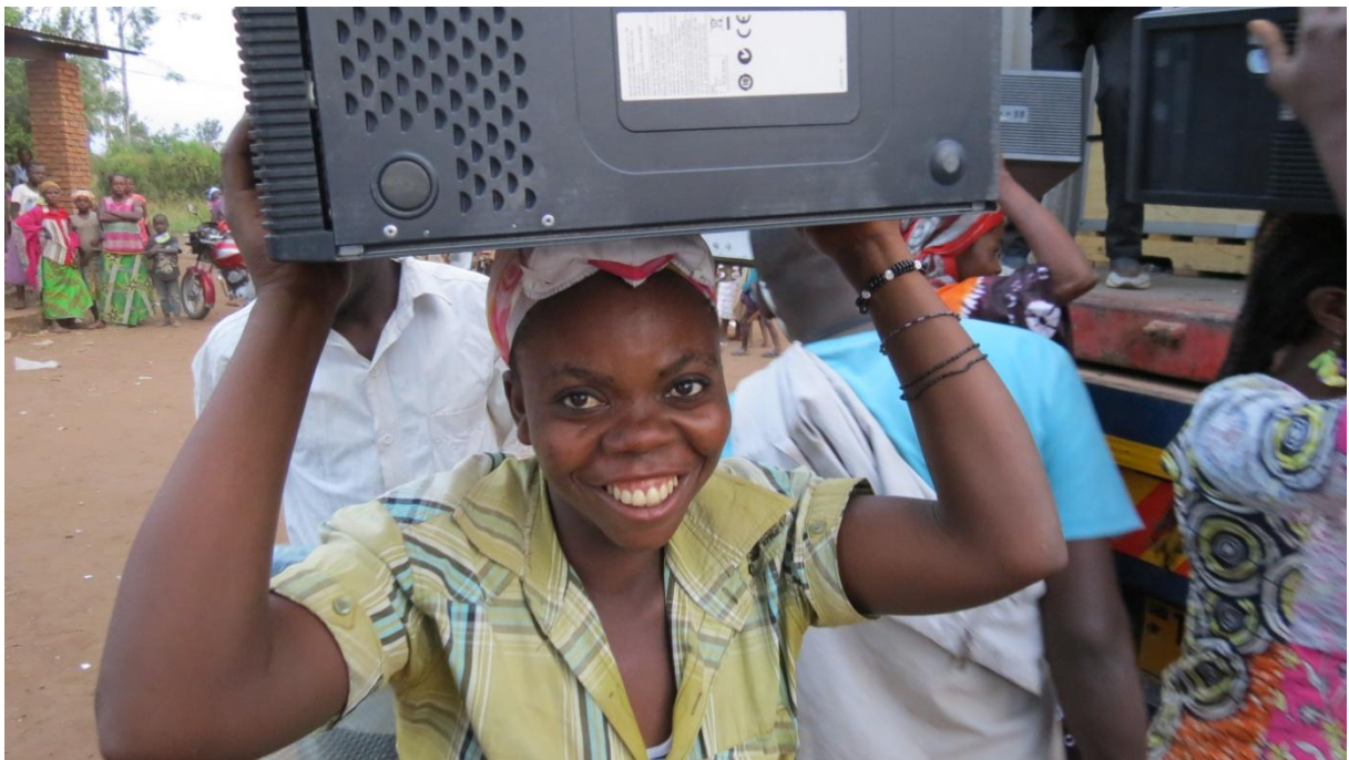
The community offloading computers from the container and they are very happy to see many computers donated from Australia.