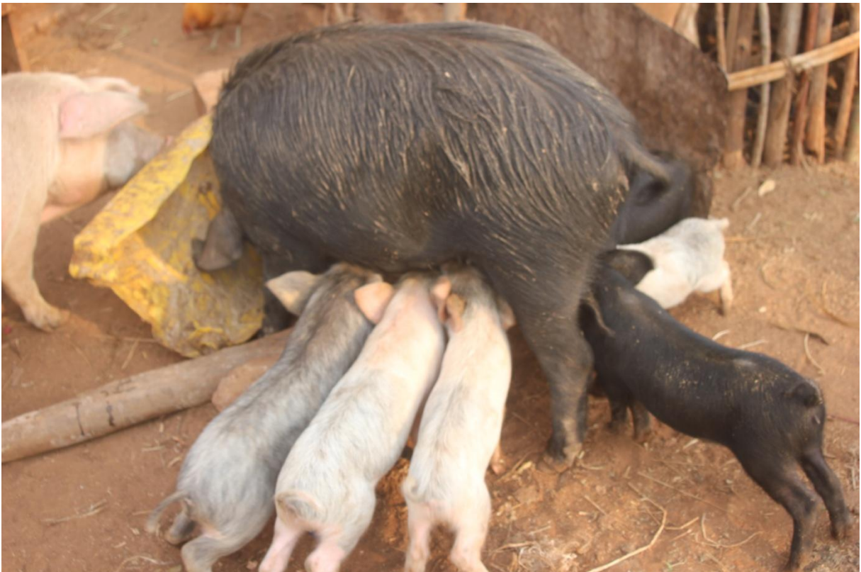
These are some of the pigs that have already given birth.