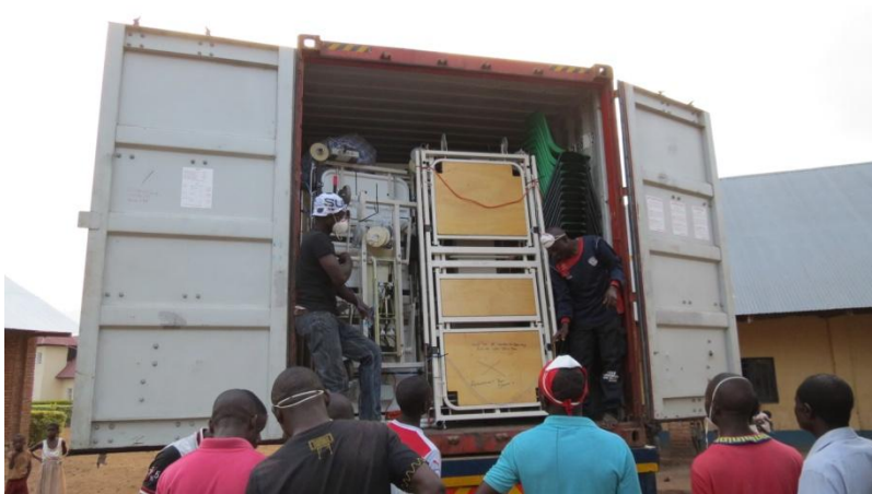
On the right side of the container are the chairs for schools that we receive. ULTRASOUND MACHINE :

We are very grateful once again to the DIK rotary Perth for donating 148 school chairs. MHCD has a technical college and midwifery school and classes have increased for this year so the chairs will be added to classrooms that didn't have chairs. The community was very happy to see the chairs their children will be sitting on.