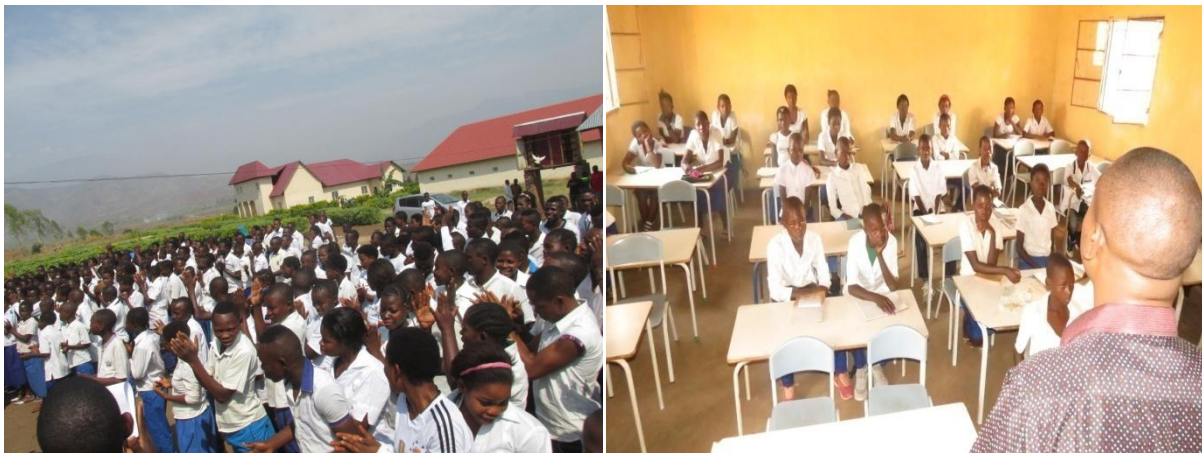
MHCD Technical college student

Education fees for one student is USD120 per year. The technical program for those coming direct from primary schools is 6 years because the secondary school curriculum for students is 6 years. For those who never completed secondary school its 3 years. We also have a certificate course for those who never got a chance to attend secondary school that runs from 6 months to 1 year .