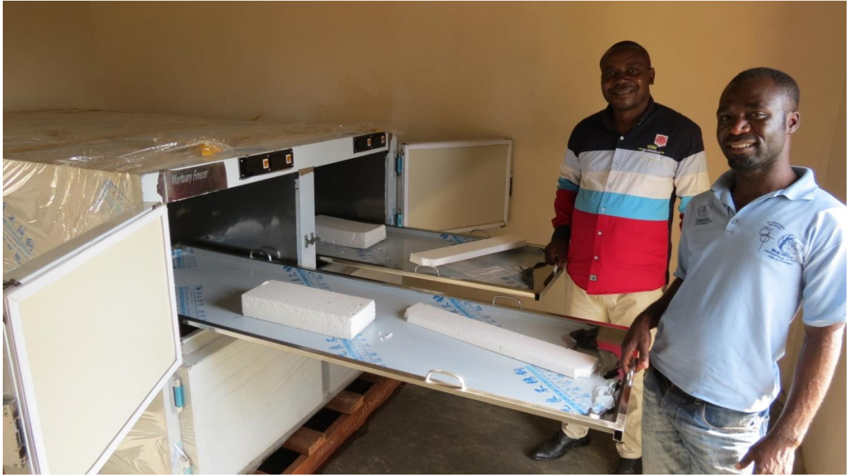
Luvungi Hospital Mortuary Freezer

We also managed to purchase medical laboratory test equipments that help the Doctors and nurses carry out different diagnosis. Our laboratory is well equipped for now.