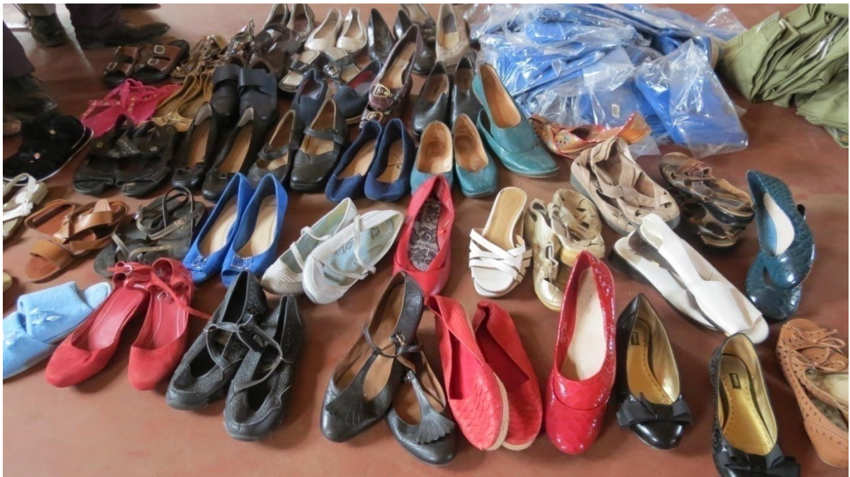
The shoes we received ready to be distributed.