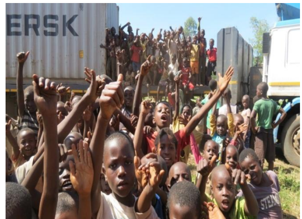
The container arriving at MHCD Headquarters, people are celebrating.