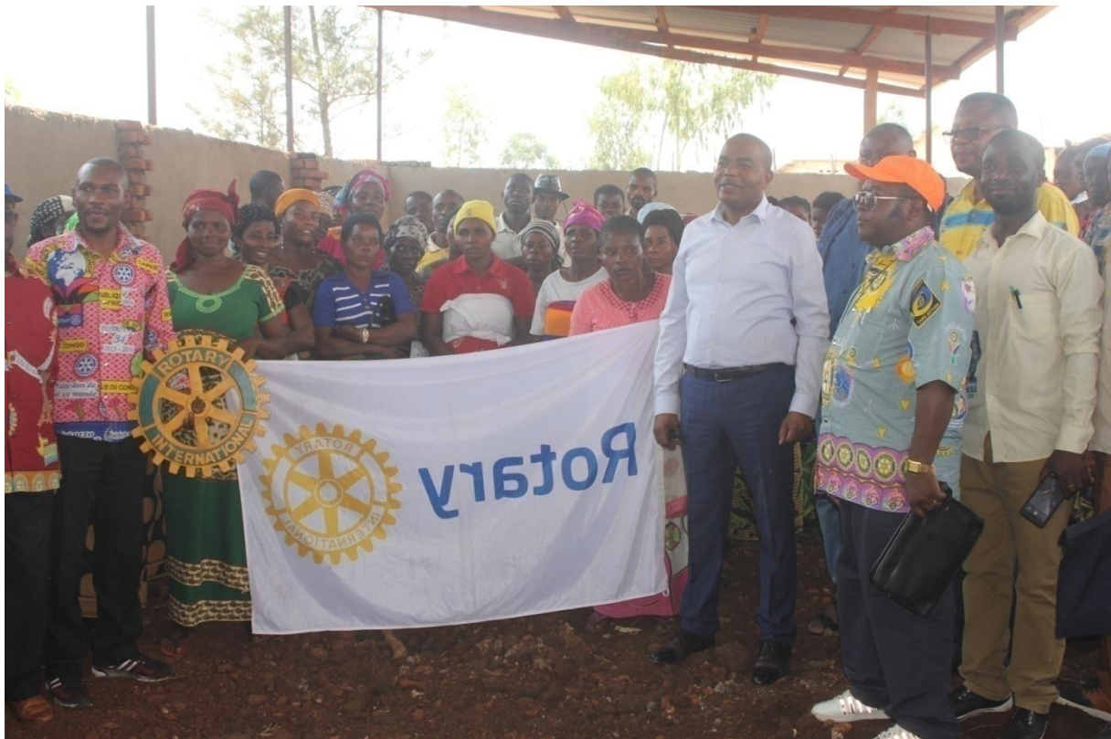
Rotary Bukavu club members with women after pig distribution.