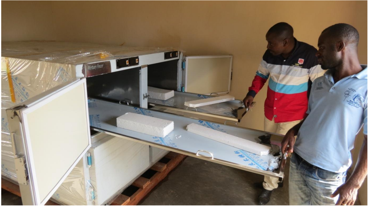
The mortuary that MHCD received recently uses solar power 24 hours. Its the only mortuary in the Ruzizi valley and the Bafuliru mountains that helps the community in conserving bodies.