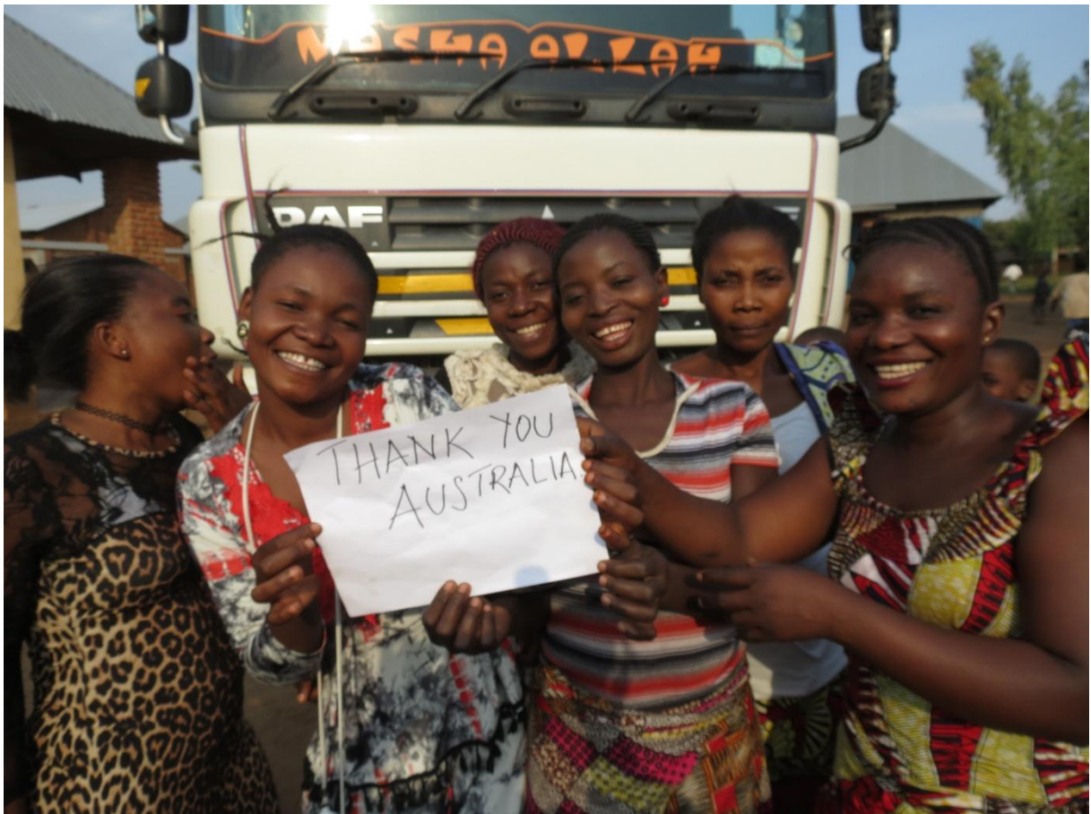
Luvungi women are very happy to receive the container.