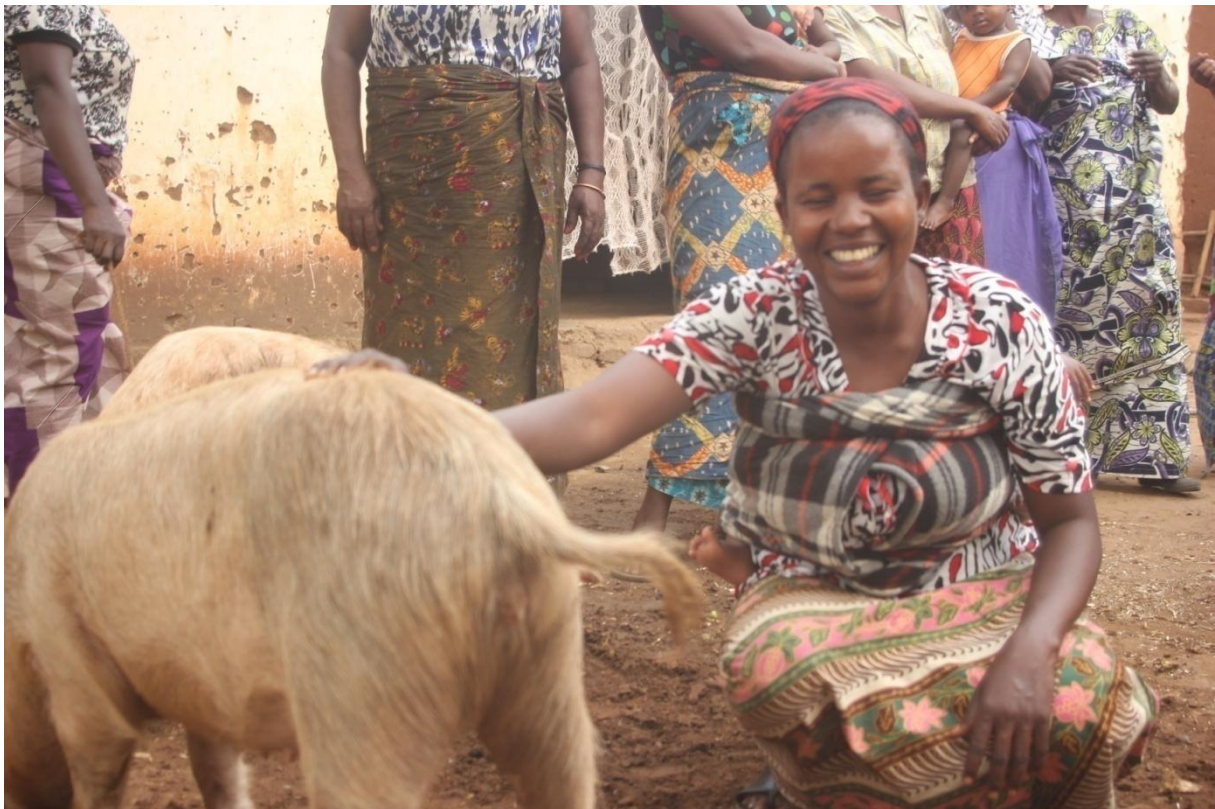
Women from different villages are happy to receive pigs