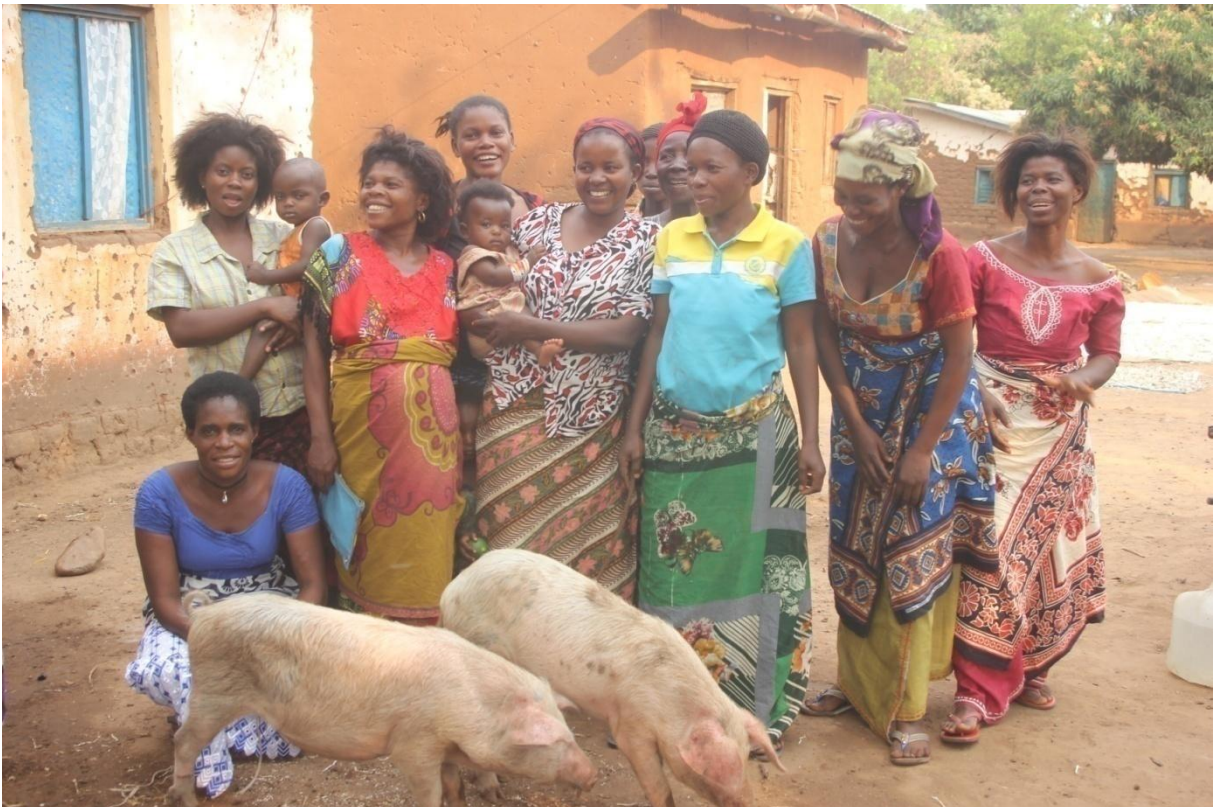
Women from one club are very happy to receive two pigs.