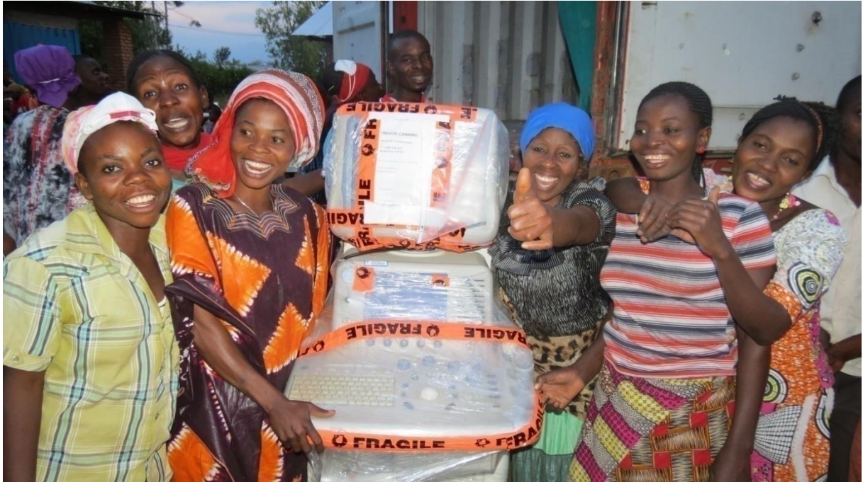
Women from Luvungi are very happy to receive their ultra sound machine .