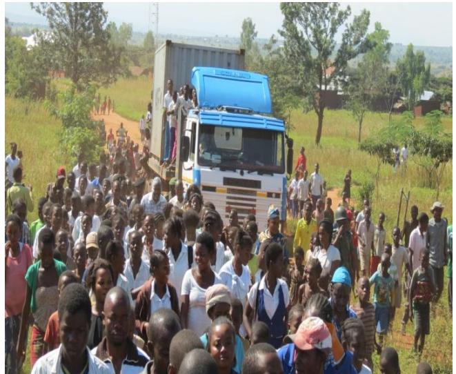
The Container from China arrive in Luvungi

When the container full of solar equipment and street lights arrived,the Luvungi population was very happy.They danced and jumped the whole day and they escorted the container upto the MHCD Headquarters.When they saw me,they were filled with so much joy and they lifted me for more than 2 kms singing and dancing because they never believed that the container can come.It was like a surprise because they had been waiting for Electricity in Luvungi for more than 5 years.The container was unloaded at the MHCD Luvungi for free.