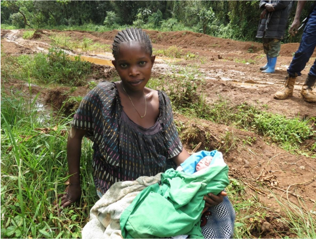
The mother is very happy and holding her brand new child.