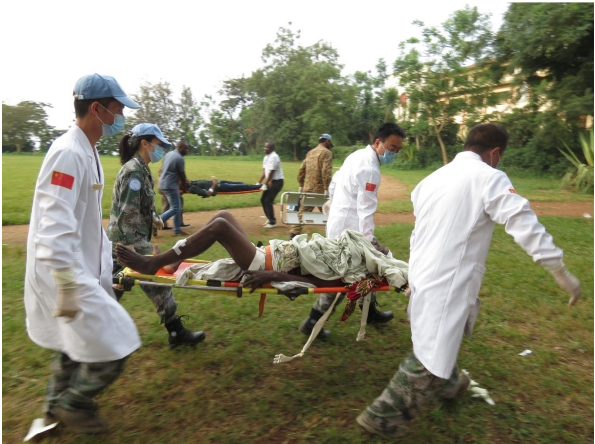
This is the UN rescue team who brought the injured people to hospital.