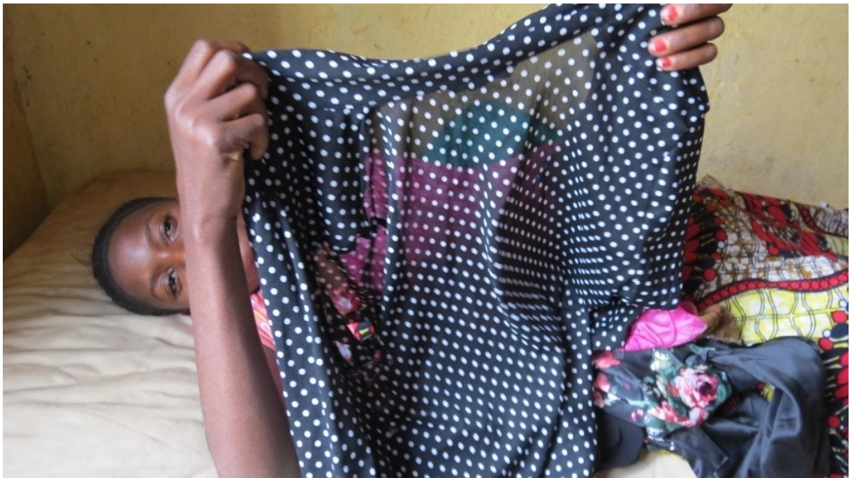
The above lady has been Hospitalised after operation and she also received clothes. She is very happy.