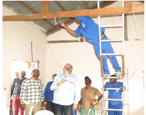
Dean and Congolese electricians are installing street lights poles and wiring one of the hospital wards.