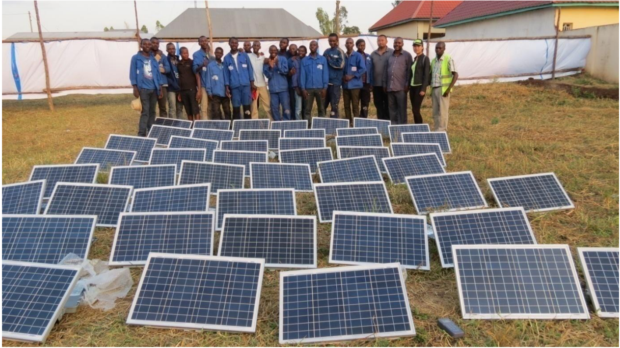
The electrical students with their instructor plus the chinese Engineers for a family photo.They worked day and night so that Luvungi maybe lit.