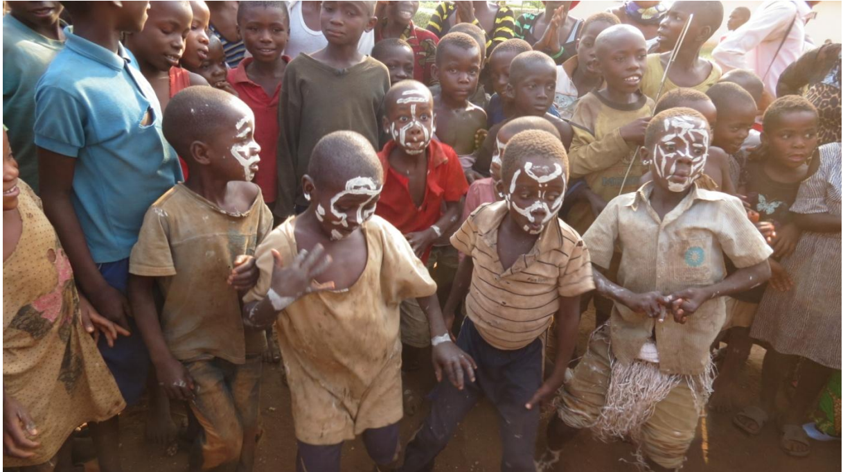
Children of Luvungi create a dancing club and are dancing before the container thanking the Australians who donated goods for MHCD.