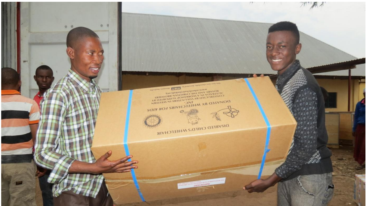
Luvungi community offloading wheelchairs from the container.