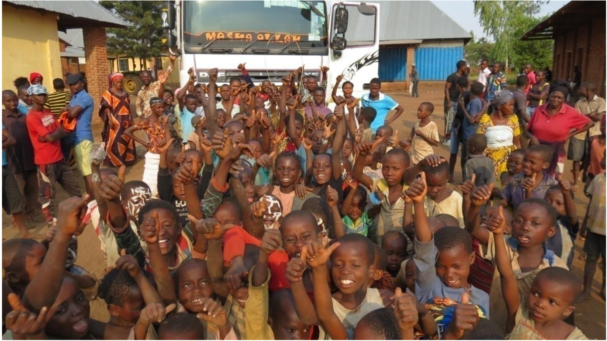
Children of Luvungi community are very happy to see the container