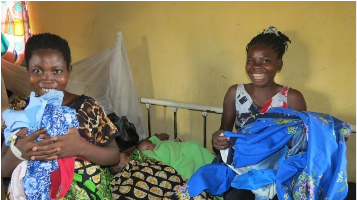
The above women gave birth at the Luvungi MHCD Hospital and they were very happy to receive their clothes and those of their babies plus the covers.

We received also some uniforms from Rotary club perth that we distributed to the MHCD staffs and other people. They were nice shirts and pair of trousers that they are putting on and its helped them to have clothing. The patients and all of them were very happy to receive the gifts from Australia.