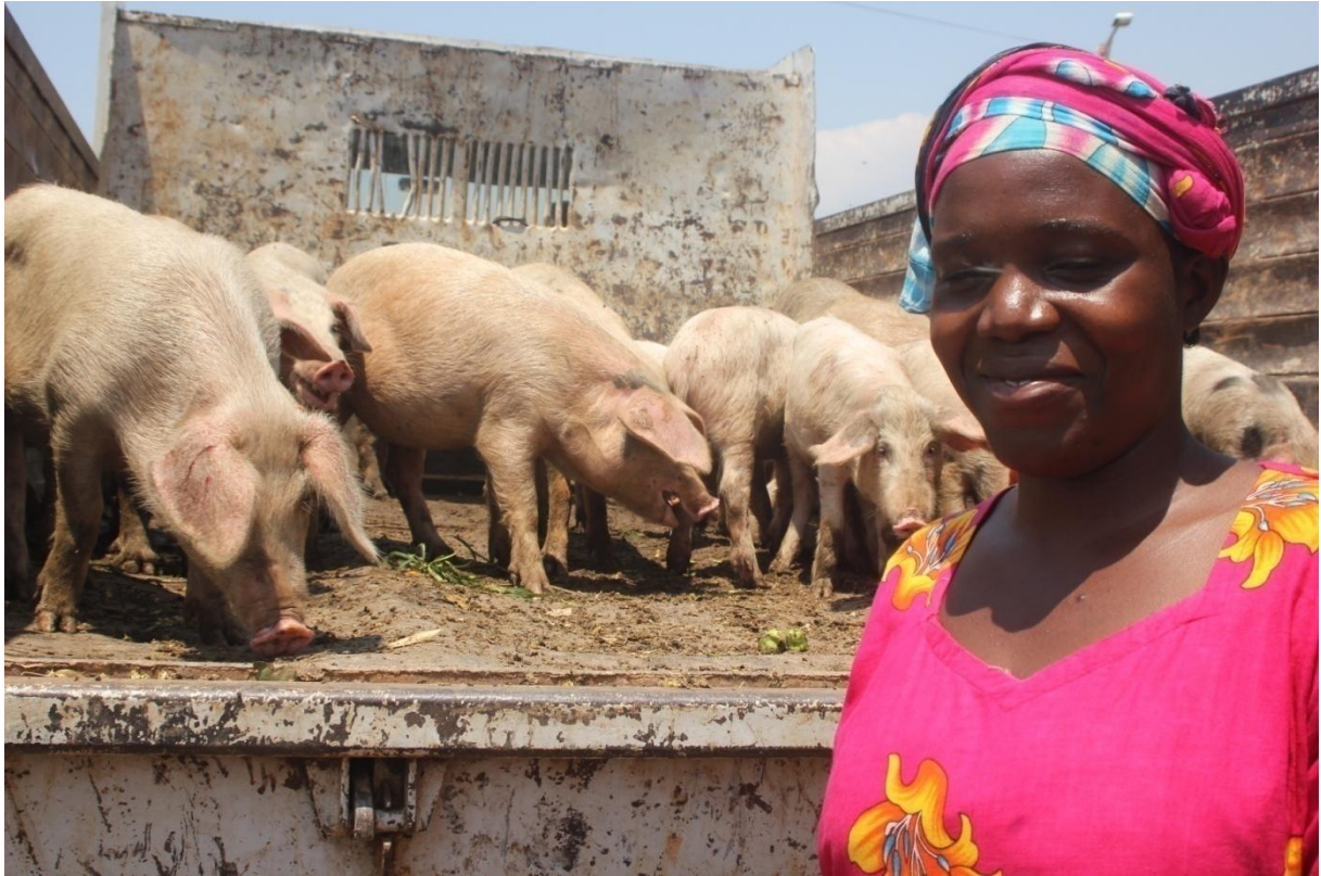
Pigs loaded on trucks ready to be distributed to a village .The women leader is very happy to receive them.