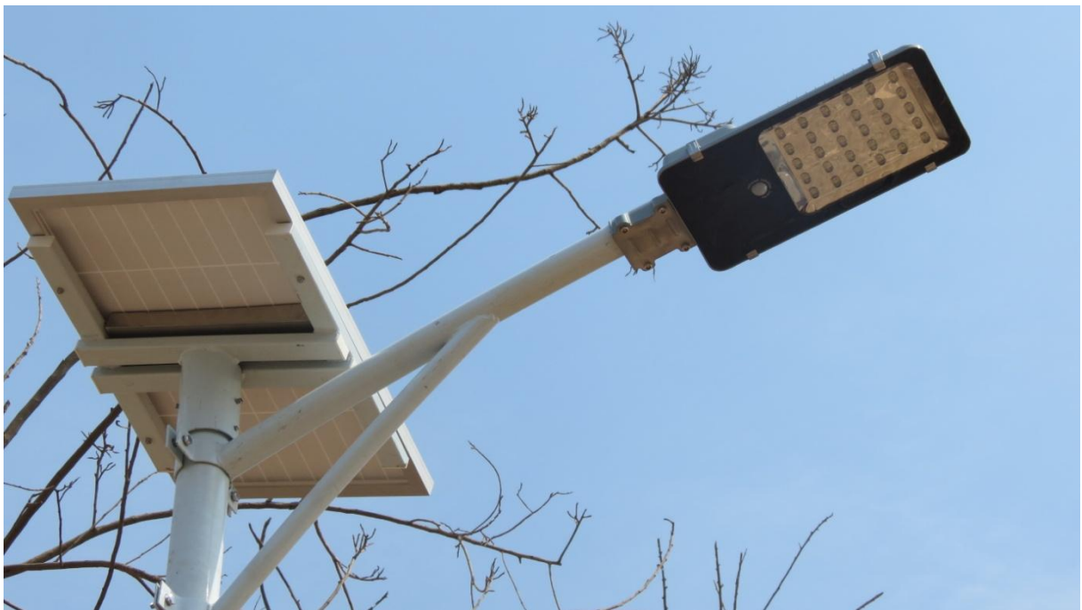
MHCD Solar street Light