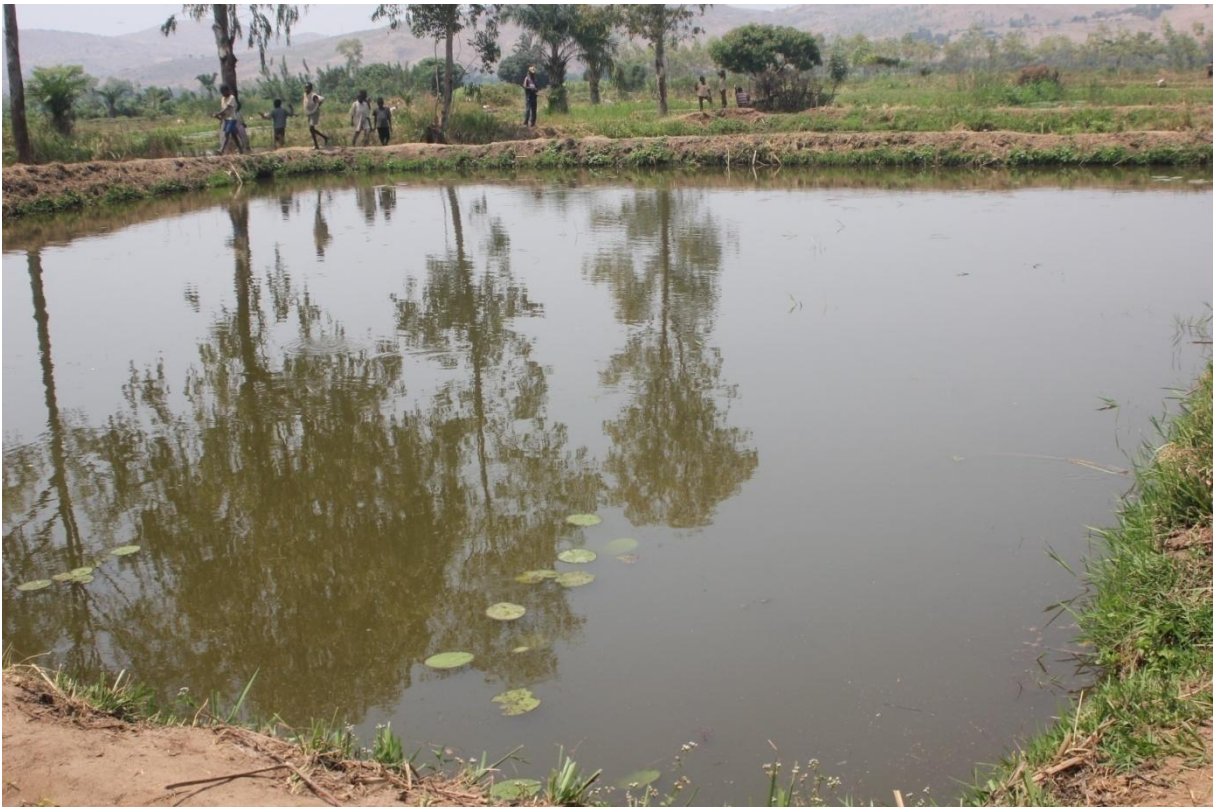
Another fishpond from other villages.