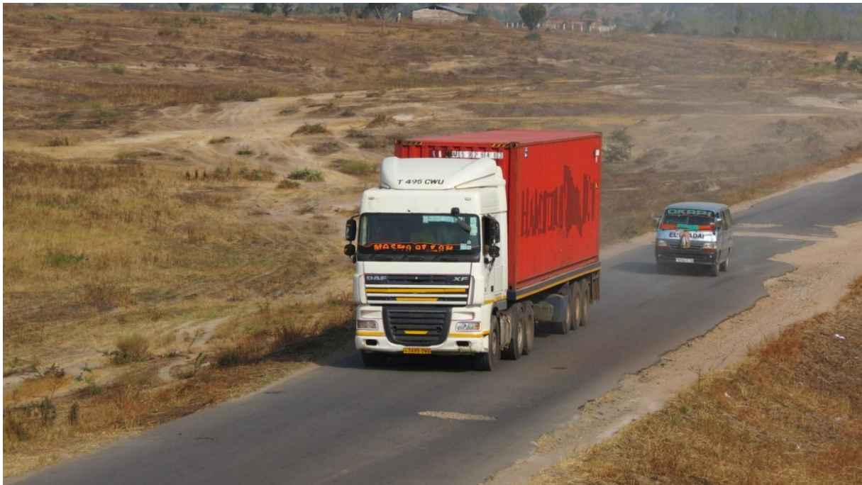
Container on its way to Luvungi

Am so grateful once again to all MHCD friends and supporters who donated their time and brought items to be packed. I really appreciate all your efforts and sacrifice.