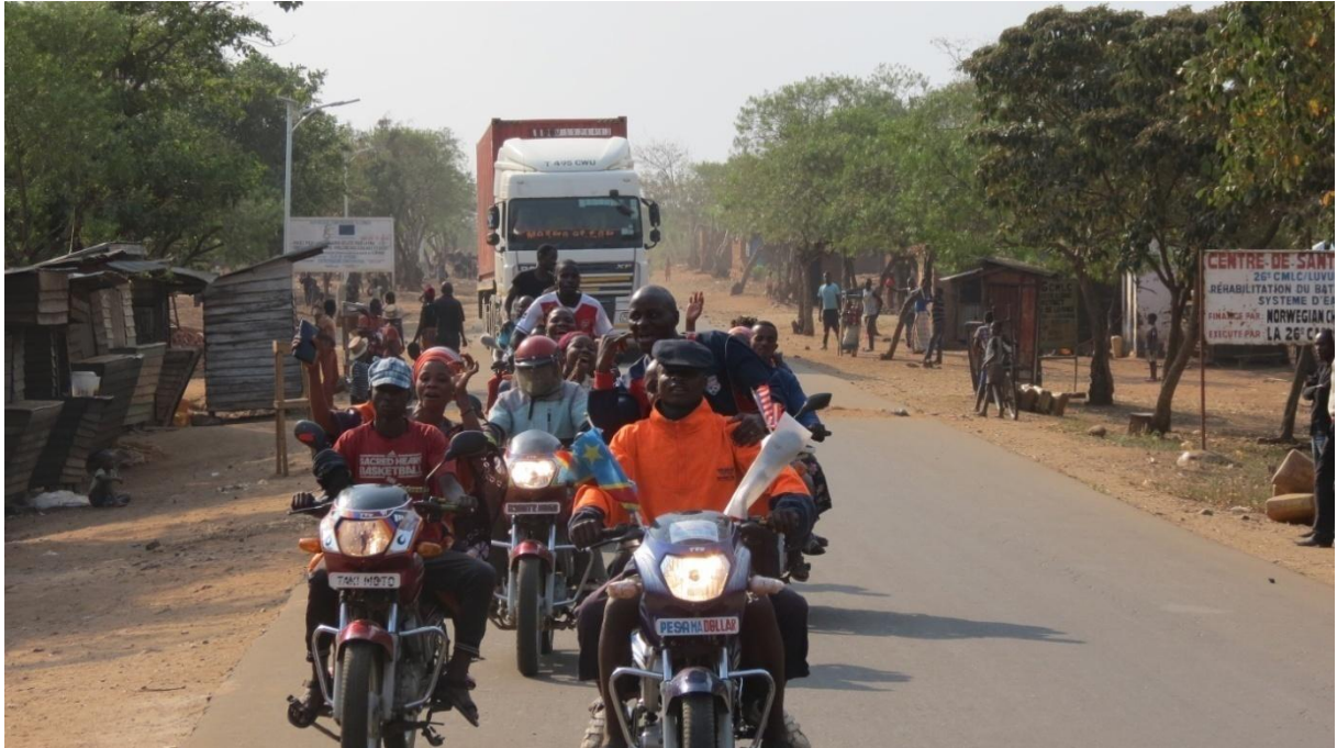
Container arriving in Luvungi and the youth have come to receive it with motorbicycles.