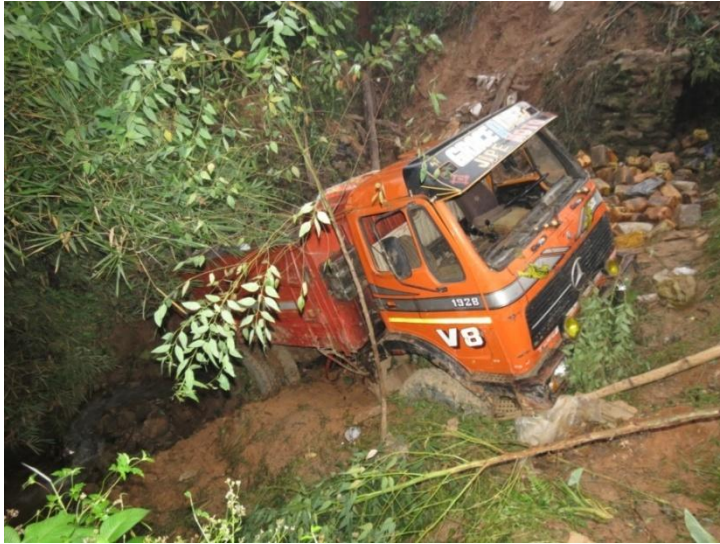
This is the truck that fell off the cliff.

I contacted the UN peacekeepers in Bukavu and they sent two helicopters and 3 ambulance which allowed us to bring 12 of the badly injured people from there to the Bukavu general hospital. Thanks to the Monescu (UN in DRC) help, they arrived in 30 minutes and 11 of them are now recovering in hospital. Unfortunately though, one lady died from her wounds. However, we thank God for the lives that were saved and people in the South Kivu Province are happy that we all assisted so quickly with this disaster.