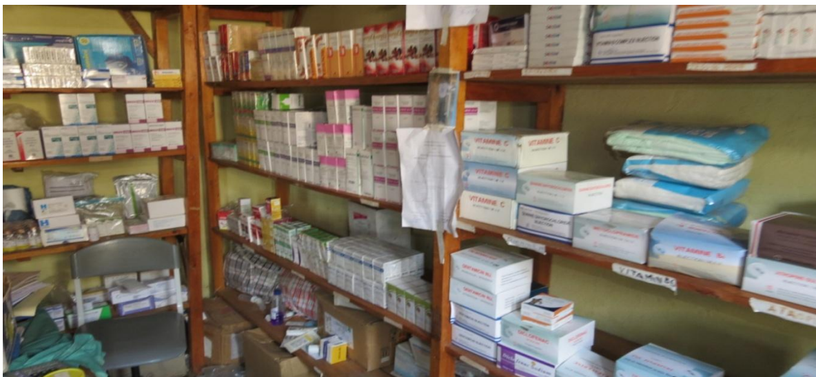
MHCD Luvungi General Hospital Pharmacy full of medicines.