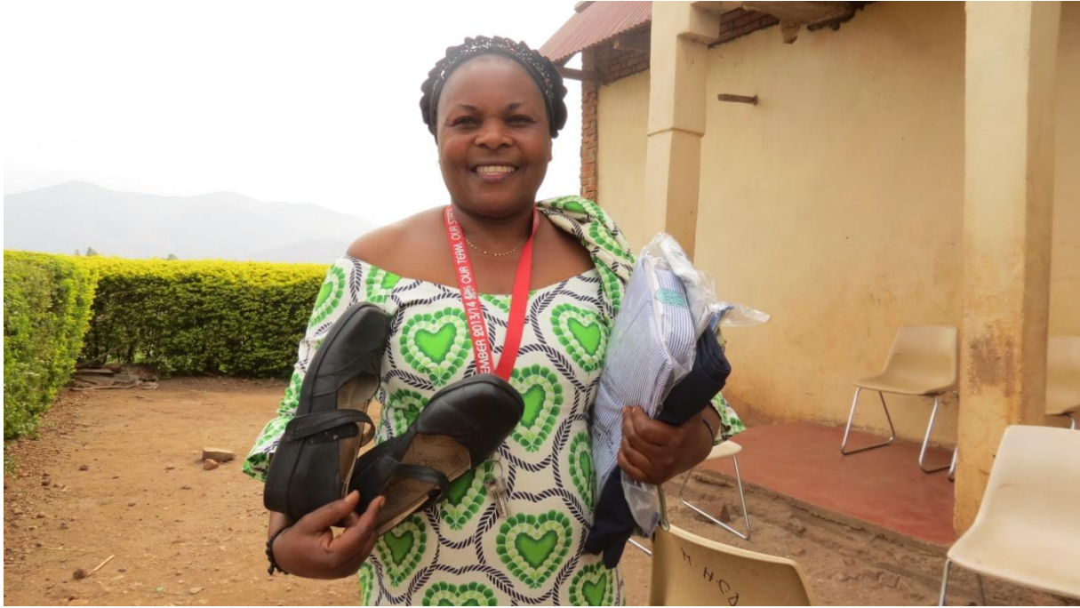
The above lady is happy to receive shoes and clothes from the container.