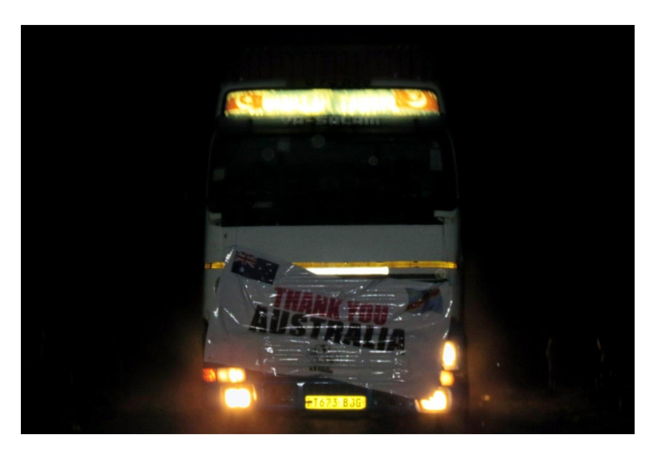
THE CONTAINER ARRIVE IN LUVUNGI VILLAGE

Amongst the goods in the container we had the following;