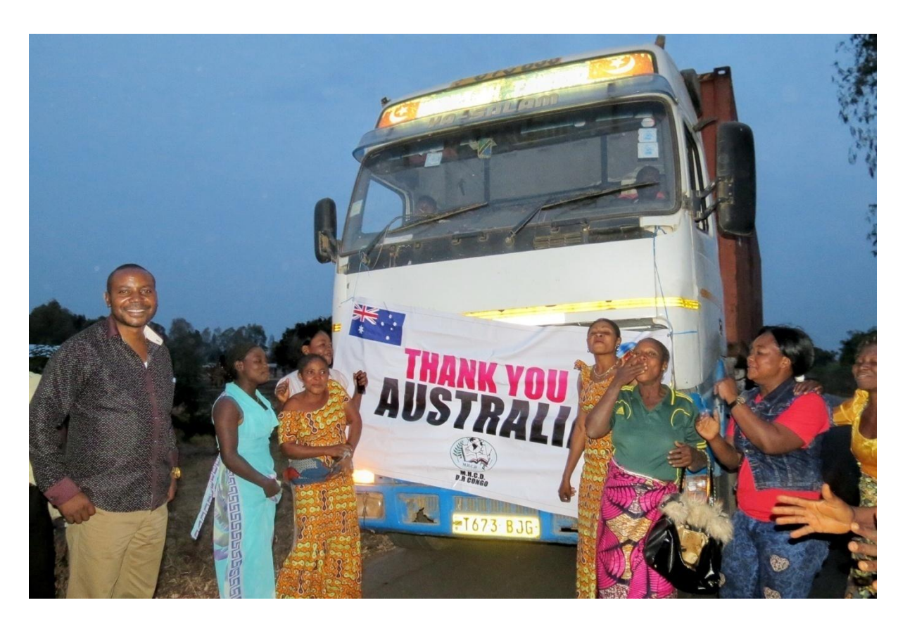
LUVUNGI PEOPLE ARE HAPPY TO RECEIVE THE CONTAINER

Again thank you very much for all your sacrifice and efforts and please may you not tire.